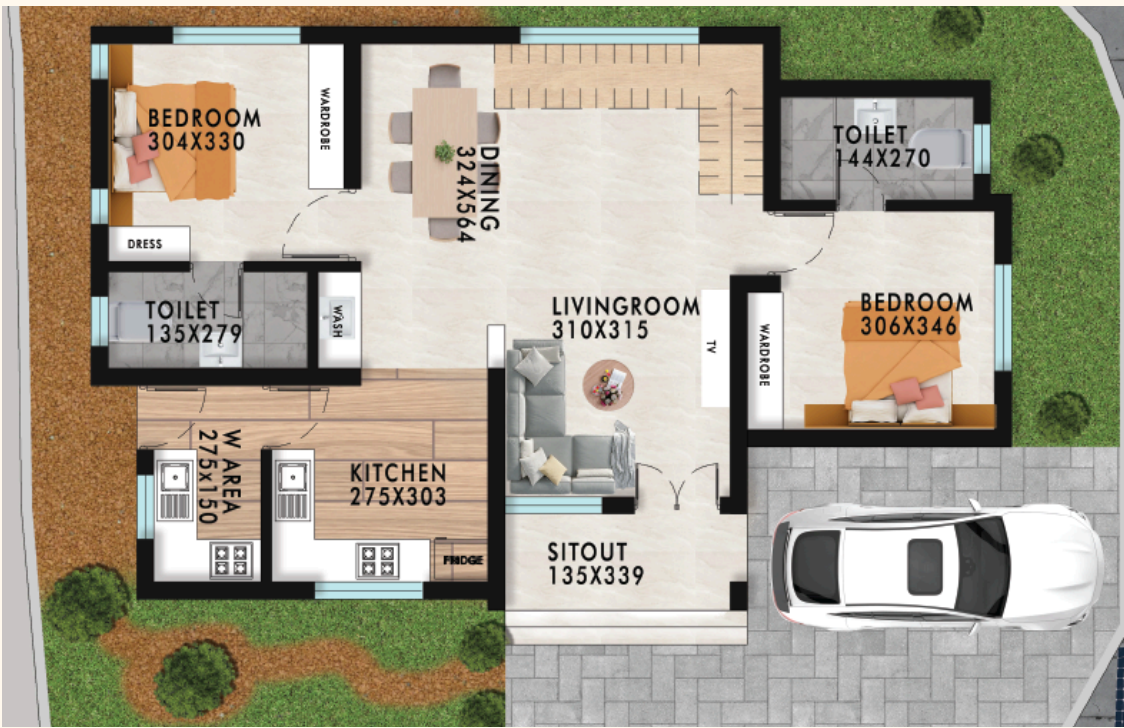
Unit A - Floor Plan Ground Floor