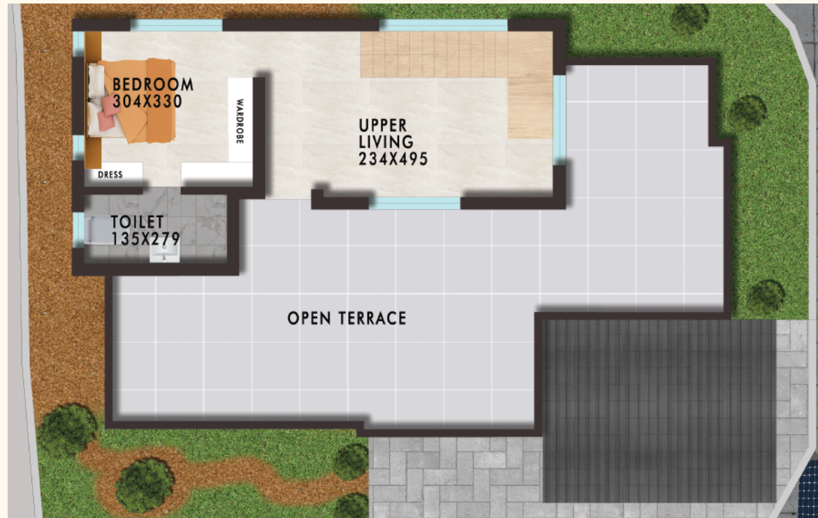
Unit A - Floor Plan First Floor